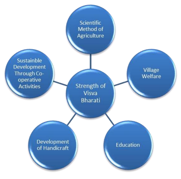
Strength of Visva-Bharati

The agricultural activities were based on three phases- (i) experiment; (ii) training, and (iii) extension. Extension activities were given much priority